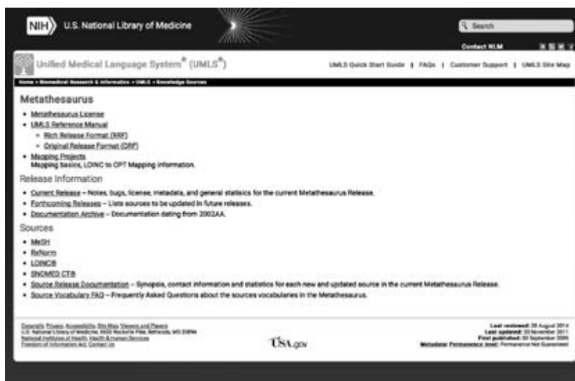
Figure 2. UMLS Meta-thesaurus Interface

In order to allow for the complex description that includes acronyms and abbreviations indexed in the Systematized Nomenclature of Medicine, UMLS developed the Rich Release Format (RRF) (Chute, 2005: 176). For complete retrieval of information of both MeSH terms and alternative names, better search strategies must be incorporated. Nonetheless, Meta-thesaurus has the merit of using metadata to provide a greater search scope, which with headings is insufficient. It has nearly forty labels, the most representative of which are the following table.